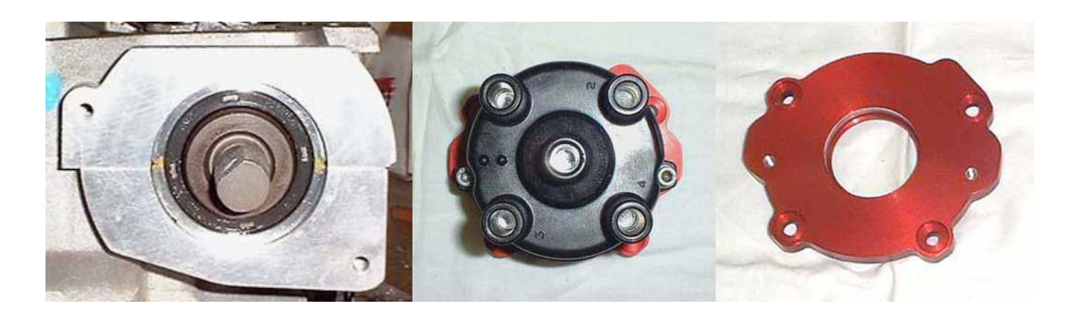
Comparative positions of rotor arm spigot for standard and VVC inlet cams